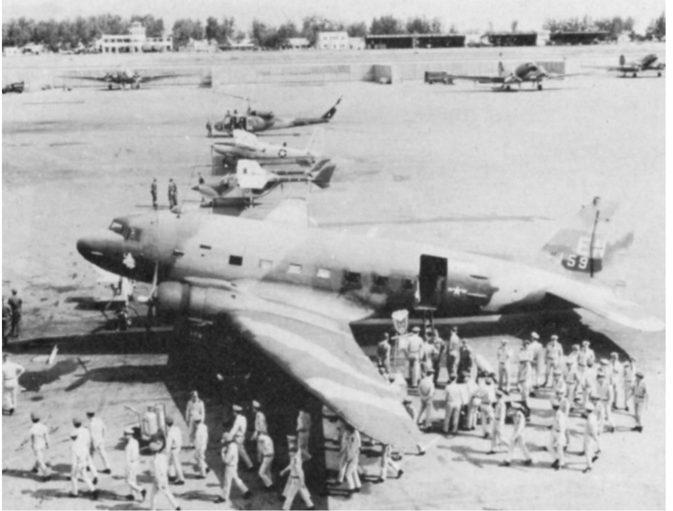
361 TEWS aircraft