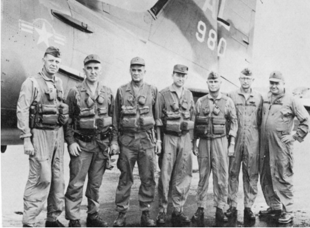
361 TEWS EC-47 crew.