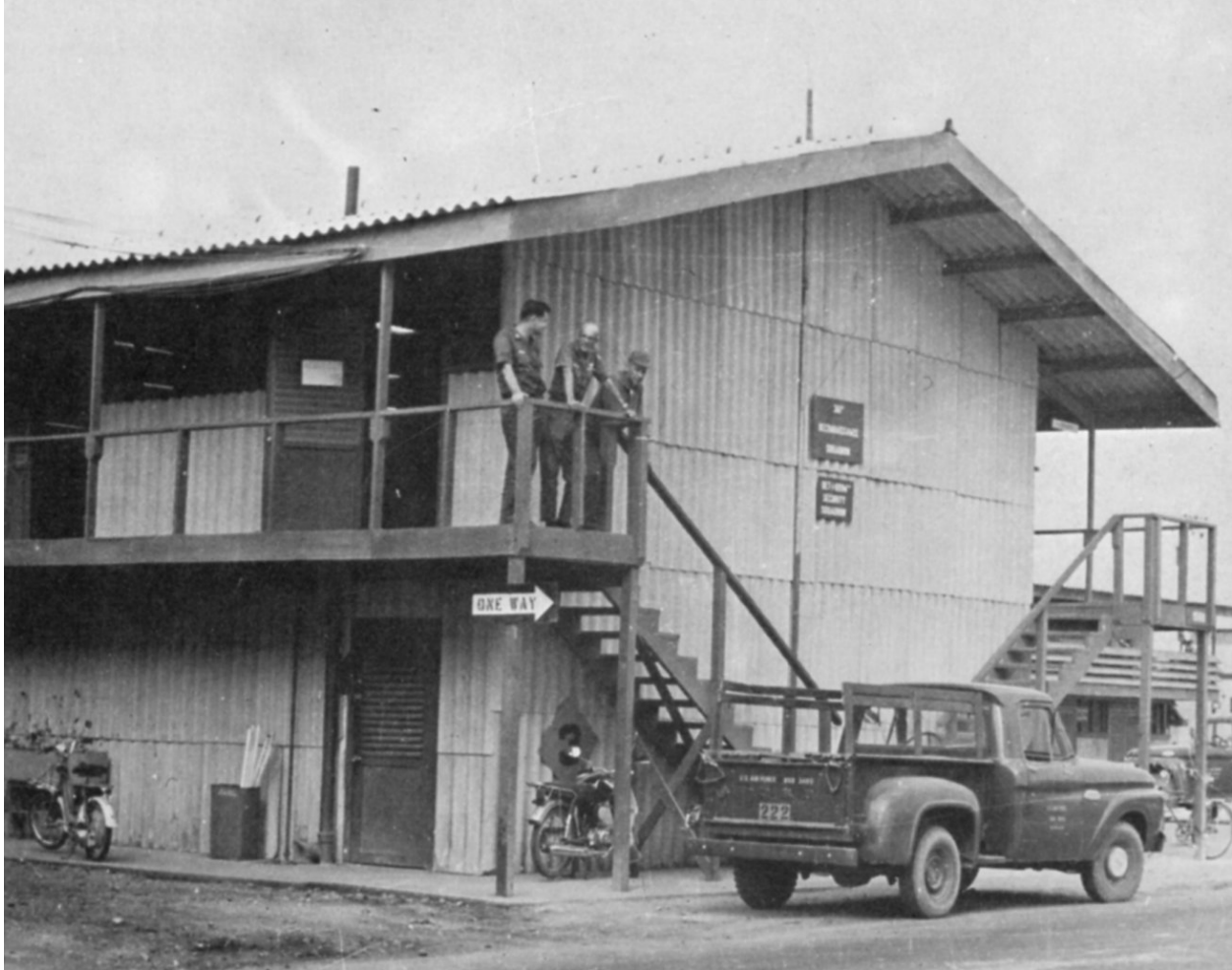
361 TEWS operations building