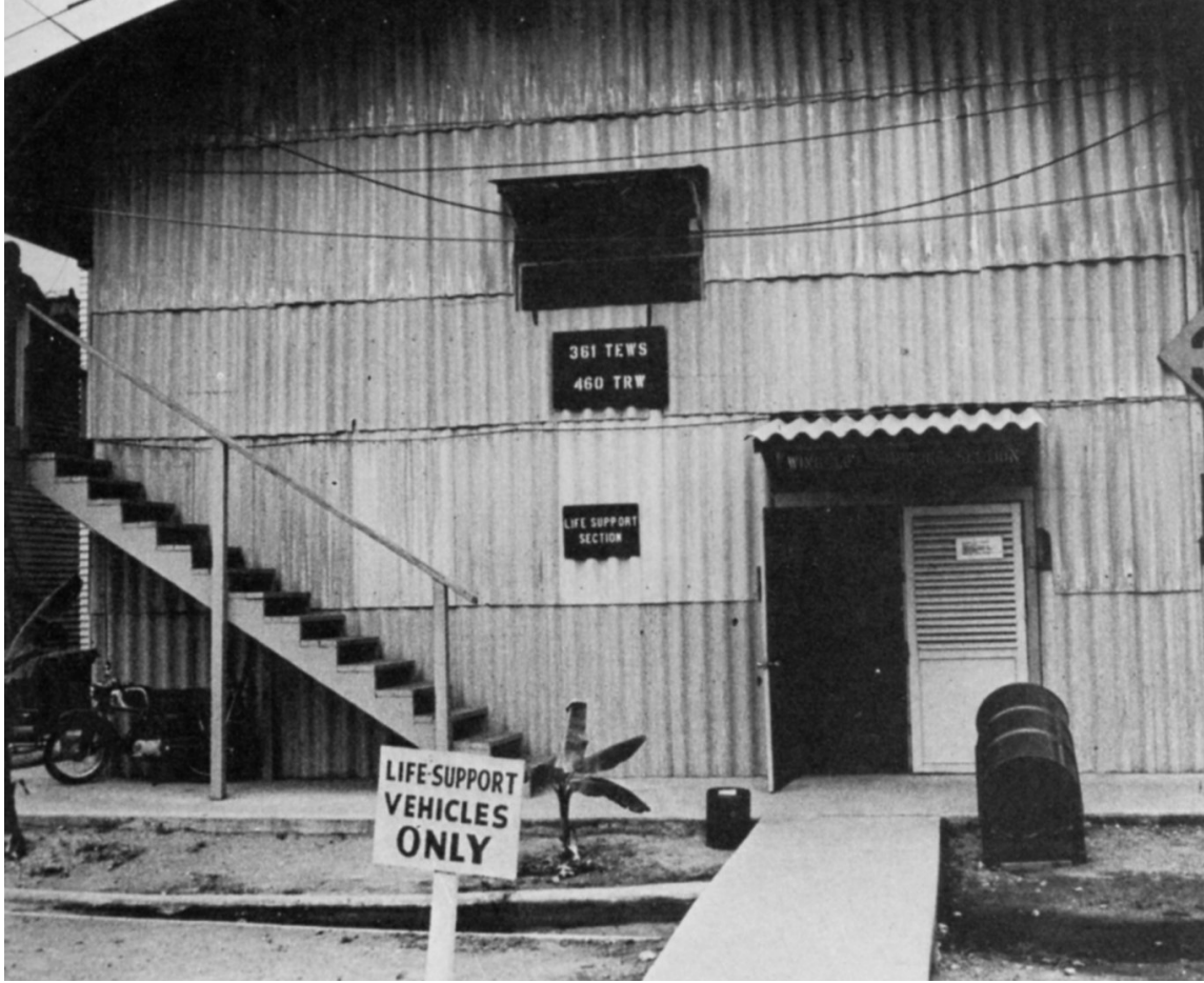
361 TEWS operations building.