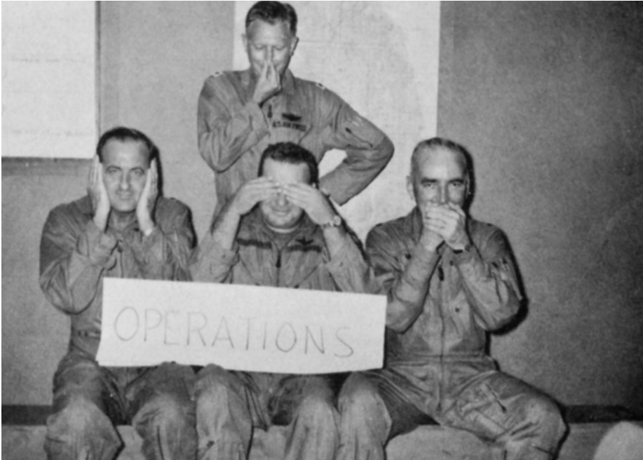
Hear no evil, See no evil, say no evil and SMELL no evil?