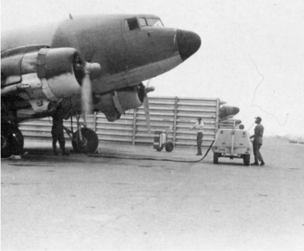
361 TEWS aircraft starting engines.